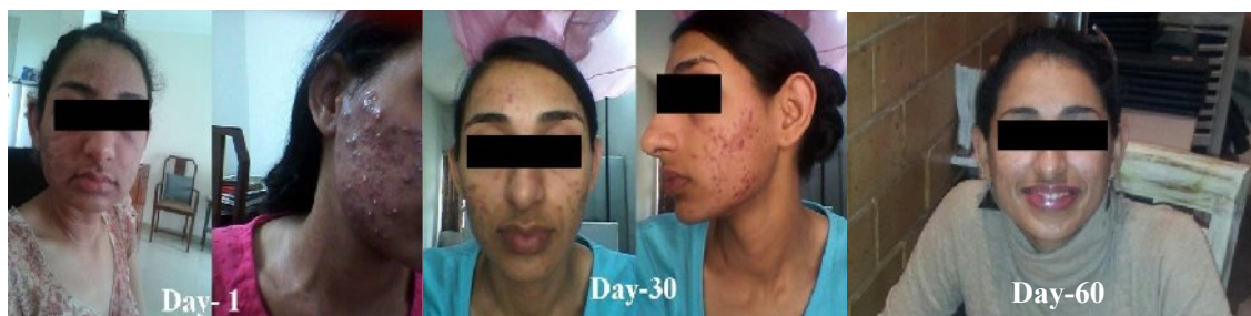
Figure 1-3. Changes in lesions across 60 days

Our patient showed marked improvement in her symptoms during the course of the treatment. The entire intervention was given for 30 days. There was considerable reduction in the eruptions and inflammation on her face. During 3 rd day of fasting, 3- 4 new eruptions appeared which gradually disappeared during the course of fasting. At the end of her stay her skin was much clearer and there was no inflammation or swelling. The sequential changes are demonstrated in figure 1, 2 and 3 respectively. The patient does not express any sort of discomfort during the entire course of treatment. The entire timeline of this case is depicted in Figure 4. The patient was followed up for a month post intervention, but no relapse of symptoms was reported.